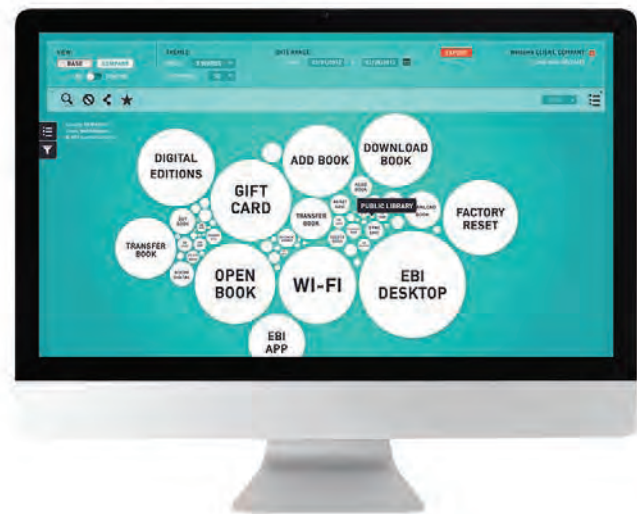
UX UI Design example

LONDON Kemp House 152-160 City Road London, UK EC1V 2NX T: +44 (0)20 3598 2601