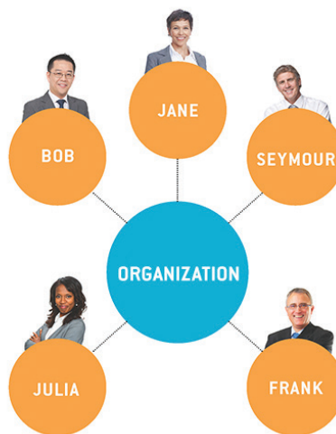
User Persona example

LONDON Kemp House 152-160 City Road London, UK EC1V 2NX T: +44 (0)20 3598 2601